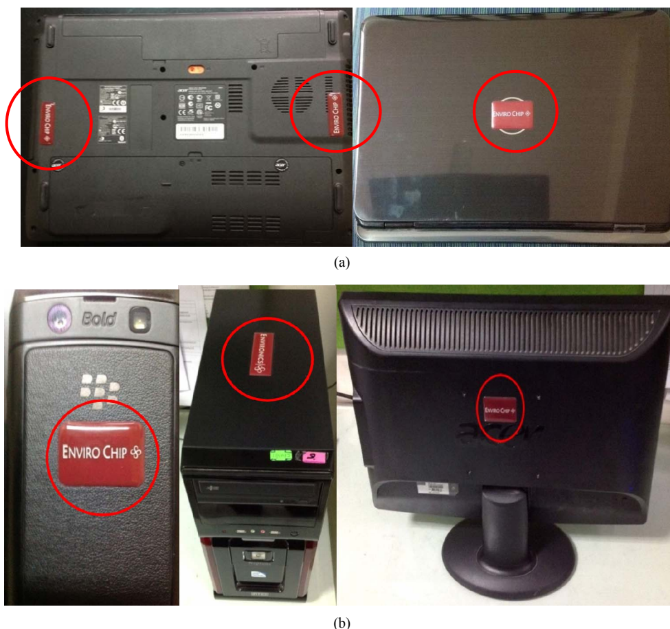
Figure 1. Position of Enviro Chip on laptop (back and front), mobile and CPU of computer. (a) Enviro Chip (in red circle) on the back and front of Laptop; (b) Enviro Chip on mobiles, central processing unit (CPU) and monitors of computer.

This was a double-blind crossover study conducted at Max Super Speciality Hospital, New Delhi, India ( Figure 2 ). It was approved by the ethics committee of the Max Healthcare. It has also been registered with the relevant National Body (Clinical Trial Registry of India). Two hundred and five subjects provided their consent to the study but the final analysis was done on 155 subjects since 50 subjects failed to provide the required number of pulse readings due to rejection of abnormal readings from the analysis. Abnormal pulse reading was defined as > or <10\% from the mean data determined after recording of all the data. Subjects who used mobile phones/laptops/desktops for at least four to five hours per eight hour duty day, and had the pulse rate > 82/\text{min} were included in the study.