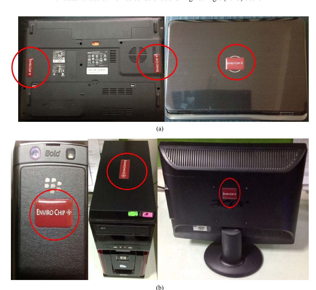
Figure 1. Position of Enviro Chip on laptop (back and front), mobile and CPU of computer. (a) Enviro Chip (in red circle) on the back and front of Laptop; (b) Enviro Chip on mobiles, central processing unit (CPU) and monitors of computer.

This was a double-blind crossover study conducted at Max Super Speciality Hospital, New Delhi, India ( Figure 2 ). It was approved by the ethics committee of the Max Healthcare. It has also been registered with the relevant National Body (Clinical Trial Registry of India). Two hundred and five subjects provided their consent to the study but the final analysis was done on 155 subjects since 50 subjects failed to provide the required number of pulse readings due to rejection of abnormal readings from the analysis. Abnormal pulse reading was defined as > or <10% from the mean data determined after recording of all the data. Subjects who used mobile phones/laptops/desktops for at least four to five hours per eight hour duty day, and had the pulse rate > 82/min were included in the study.